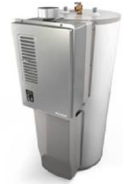
The new RH180 tank-tankless hybrid heater.

The temperature controller has 5 easily adjustable temperature settings up to a maximum