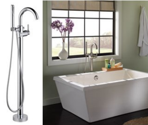
The new T4759-FL works well with contemporary collections.

Delta is very excited to be offering floor mount tub fillers—the production included collaboration with builders, designers and plumbers in many areas, including Texas. An installation video is available at Delta's website in the video gallery under Tools & Resources.