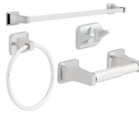
The Futura collection's timeless look makes it a great selection for hotels.

Please give us a call on your next hotel job, we would be pleased to discuss what Franklin Brass has to offer to you.